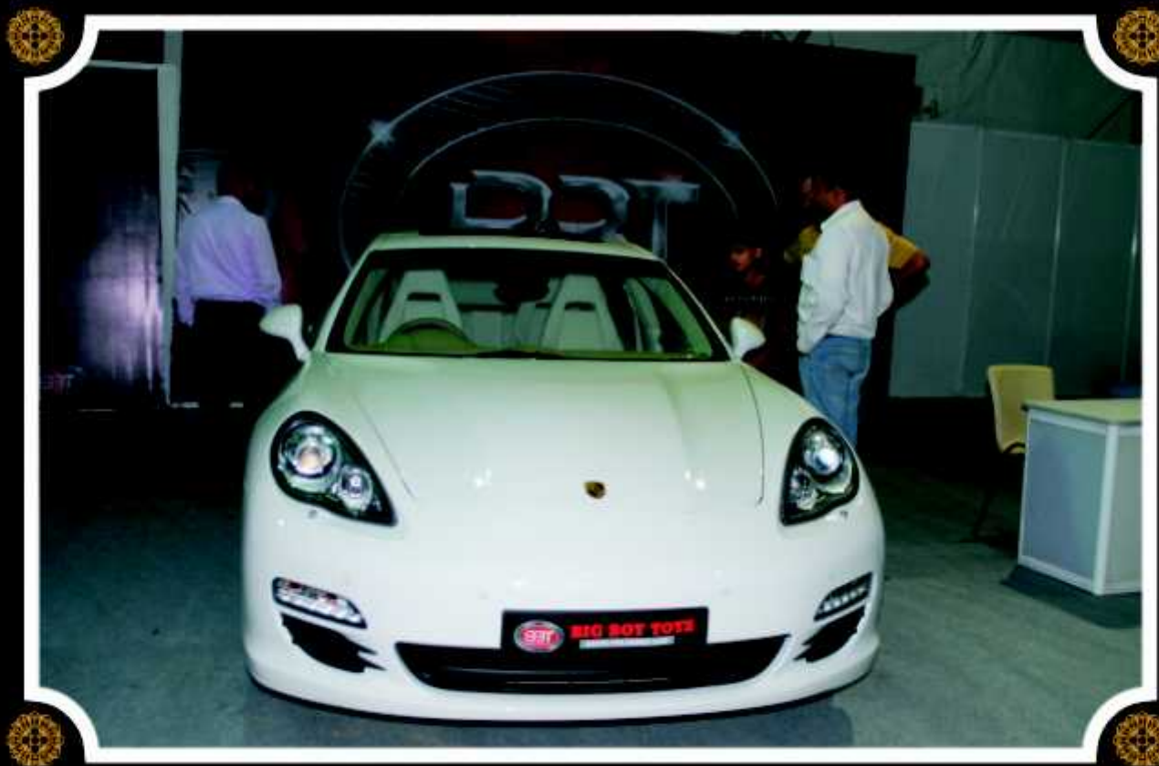
Exotic pre-owned car by BIG BOY TOYZ