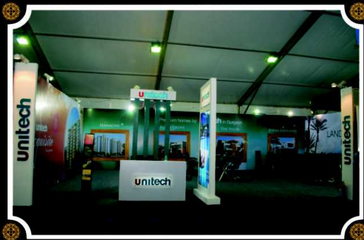
Premium & Luxury Homes from Unitech at a display