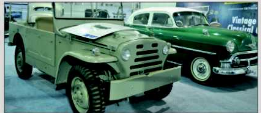
Ageless beauties grace the exhibition