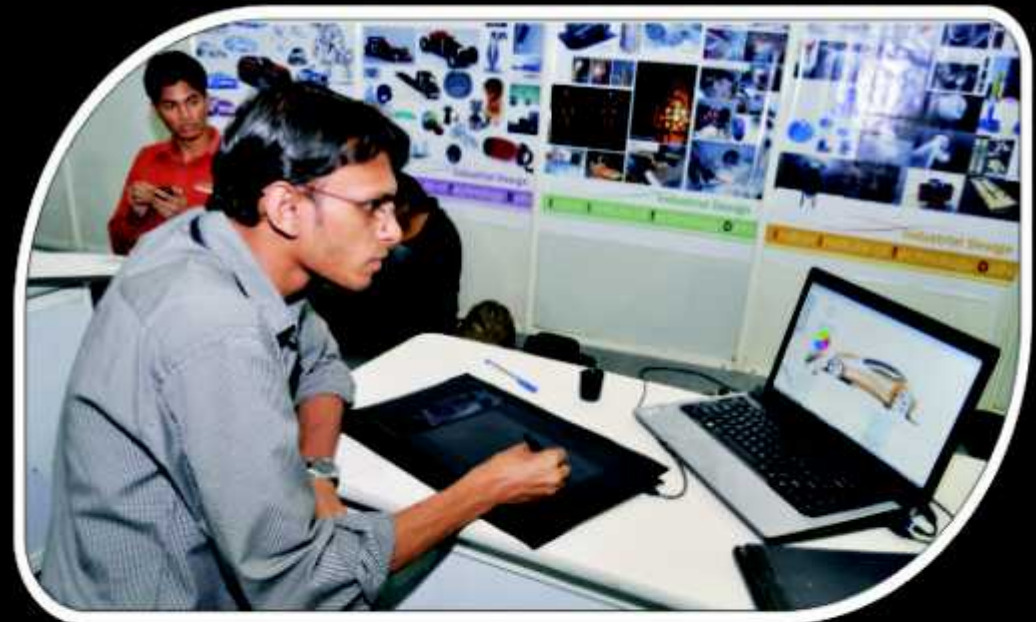
Participants trying their hands at live design