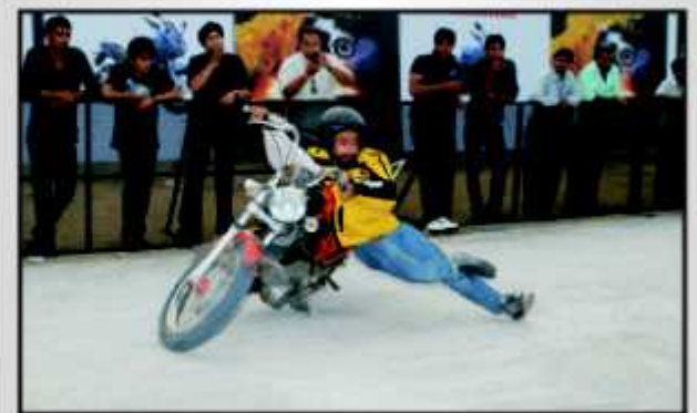
Action Reloaded- Terrific stunts demonstrated by style bikers