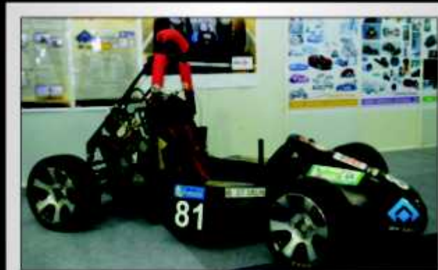
The Mind Race: Concept automobiles competing at the exhibition