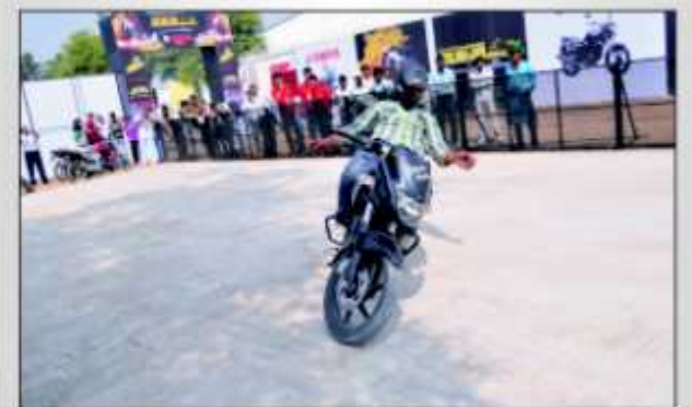
MC calling the style bikers for action