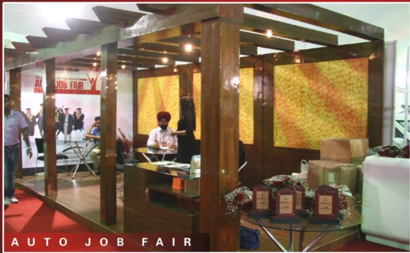
A U T O J O B F A I R

Automobile Companies and their Channel Partners are looking for qualified manpower to strengthen and expand their operations. MIS Outsourcing Pvt. Ltd., organised a unique Auto Job Fair for the visitors looking for opportunities in Automobile Sector. Councillors and HR managers conducted interviews at the Venue.